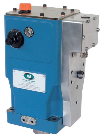
Hydraulic actuator 2800

RE's strength lies in its ability to provide comprehensive and cost effective governing, control and monitoring packages, with a full range of after sales support for applications ranging across the marine, industrial and rail traction markets.