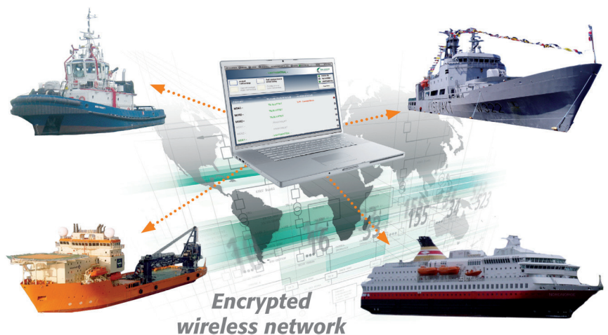
ReMACS – Remote Monitoring of Alarm & Control System for vessels at harbour

Data Process has already acted as HEINZMANN's Norwegian representative for many years, supplying this market with electronic speed governors as well as systems for power management and remote control of propulsion.