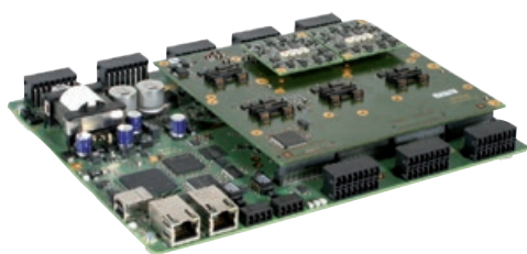
Carrier module with expander module and 2× I/O module